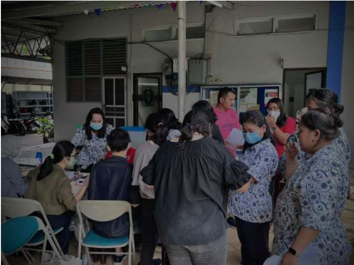
Figure 3. Activities in Checking Blood Pressure

High blood pressure, often known as hypertension, is a condition in which the blood pressure in the arteries remains consistently over normal. High blood pressure is mostly caused by hereditary factors, an unhealthy lifestyle, and environmental factors. A family history of high blood pressure, bad eating habits (heavy in salt and fat), obesity, lack of physical activity, smoking, excessive alcohol consumption, stress, and old age are all risk factors for developing hypertension. (Hoeper et al. 2013; Nerenberg et al. 2018)